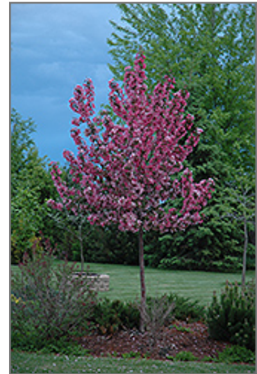
Rudolph Flowering Crab in bloom