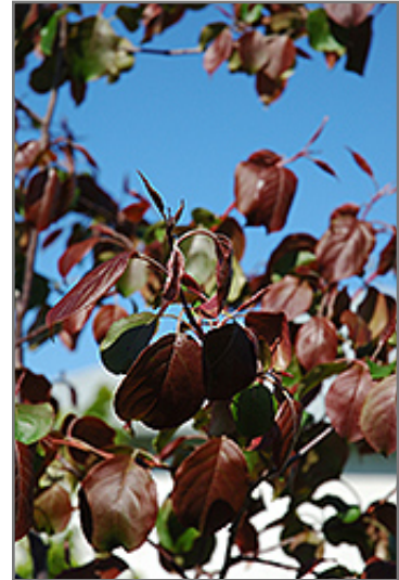
Rudolph Flowering Crab foliage

This tree should only be grown in full sunlight. It prefers to grow in average to moist conditions, and shouldn't be allowed to dry out. It is not particular as to soil type or pH. It is highly tolerant of urban pollution and will even thrive in inner city environments. This particular variety is an interspecific hybrid.