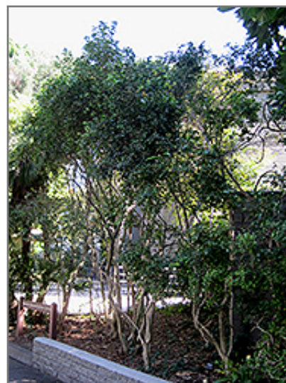
Orange Jessamine