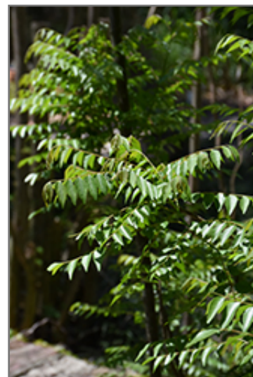
Curry Tree foliage