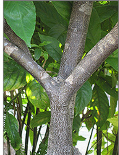
Curry Tree bark

This plant is not reliably hardy in our region, and certain restrictions may apply; contact the store for more information.