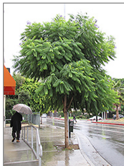
Brazilian Rosewood

Brazilian Rosewood is recommended for the following landscape applications;