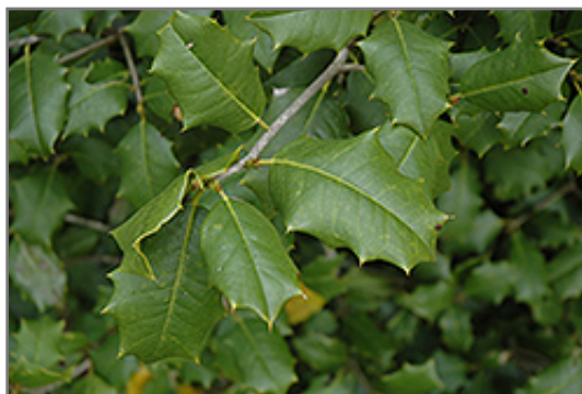
Big Red American Holly foliage