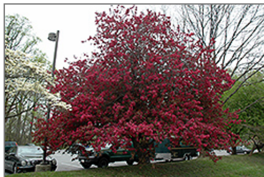
Burgundy Flowering Crab in bloom