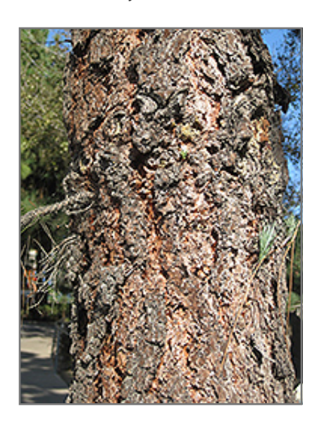
Chir Pine bark