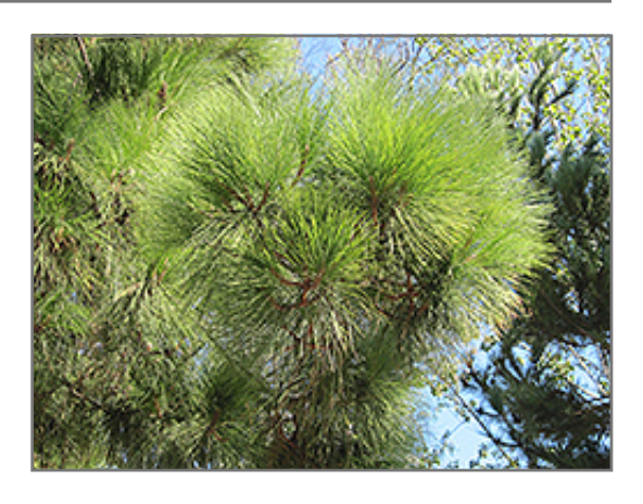
Chir Pine foliage

This tree should only be grown in full sunlight. It prefers dry to average moisture levels with very well-drained soil, and will often die in standing water. It is considered to be drought-tolerant, and thus makes an ideal choice for xeriscaping or the moisture-conserving landscape. It is not particular as to soil type or pH. It is somewhat tolerant of urban pollution. This species is not originally from North America.