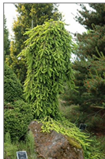
Gold Drift Norway Spruce