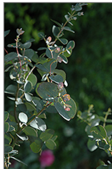
Silver Drop Cider Gum foliage

Silver Drop Cider Gum will grow to be about 3 feet tall at maturity, with a spread of 3 feet. It has a low canopy with a typical clearance of 1 foot from the ground. It grows at a fast rate, and under ideal conditions can be expected to live for 40 years or more.