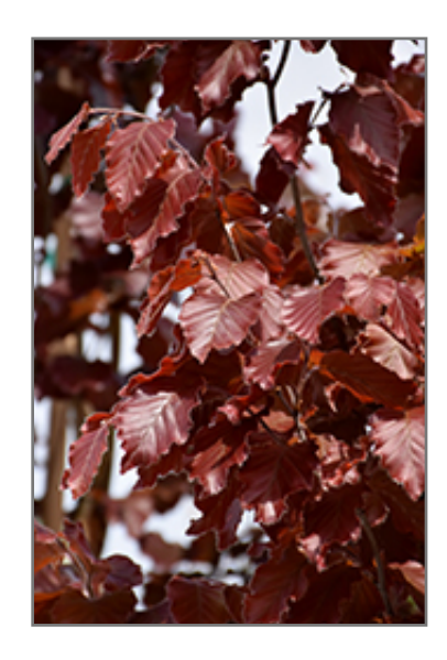
Red Obelisk Beech foliage