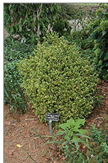
Sunburst Variegated Korean Boxwood