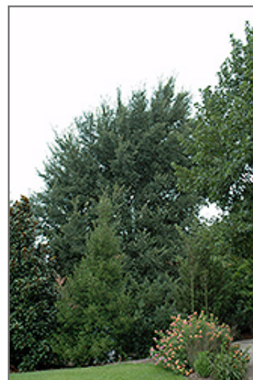
Argenteo Variegata Elm