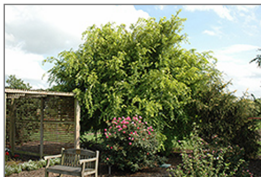
Golden Chinese Elm