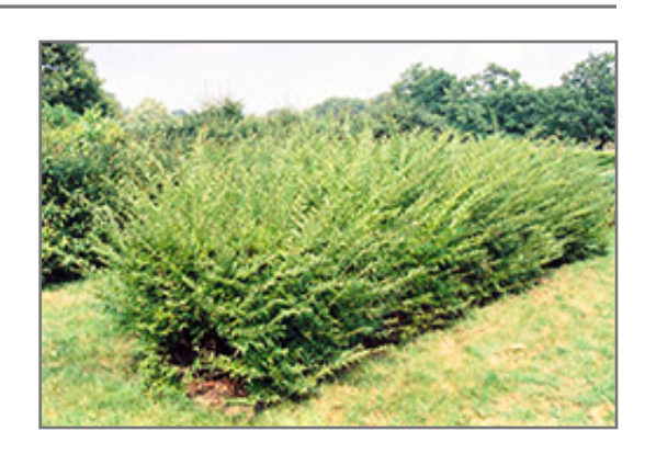
Regel Privet

This shrub does best in full sun to partial shade. It is very adaptable to both dry and moist locations, and should do just fine under average home landscape conditions. It is not particular as to soil type or pH, and is able to handle environmental salt. It is highly tolerant of urban pollution and will even thrive in inner city environments. This is a selected variety of a species not originally from North America.