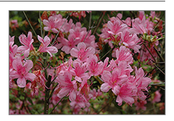
Mascot Azalea flowers