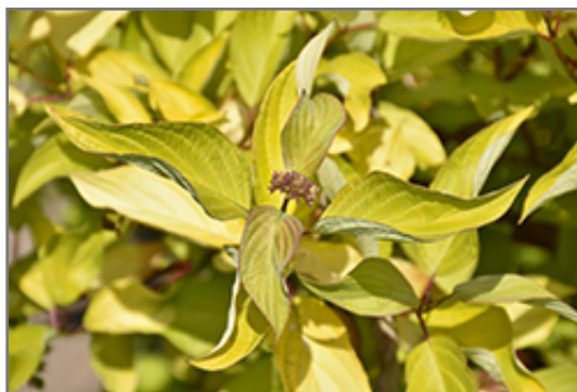
Morden Amber Dogwood foliage