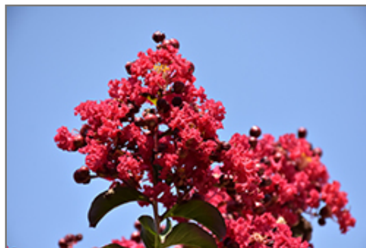
Centennial Spirit Crapemyrtle flowers