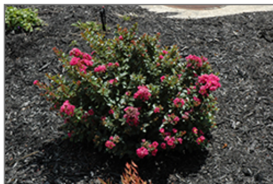
Berry Dazzle Crapemyrtle in bloom