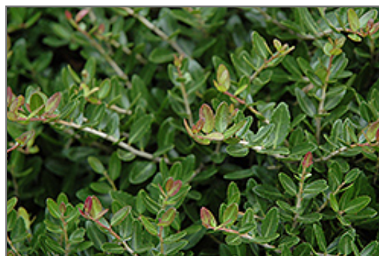
Taylor's Rudolph Yaupon Holly foliage