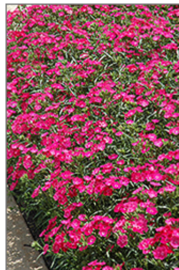
Bouquet Rose Pinks in bloom