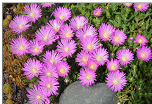
Table Mountain Ice Plant flowers