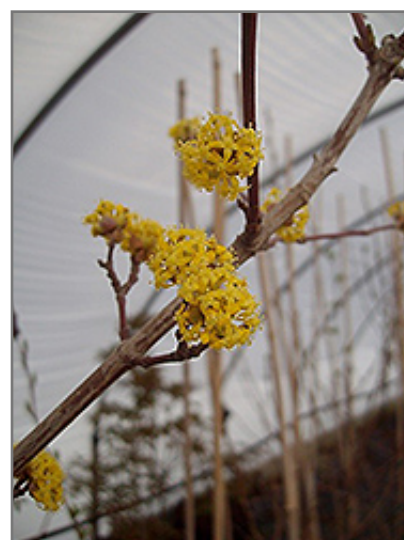
Buttermilk Sky Variegated Dogwood flowers