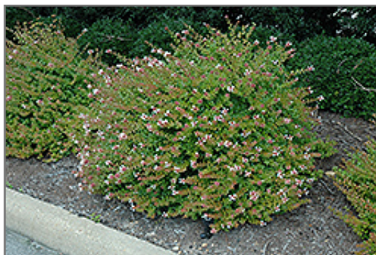
Rose Creek Abelia in bloom

Rose Creek Abelia is recommended for the following landscape applications;