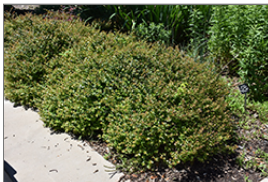
Rose Creek Abelia

Rose Creek Abelia makes a fine choice for the outdoor landscape, but it is also well-suited for use in outdoor pots and containers. Because of its height, it is often used as a 'thriller' in the 'spiller-thriller-filler' container combination; plant it near the center of the pot, surrounded by smaller plants and those that spill over the edges. It is even sizeable enough that it can be grown alone in a suitable container. Note that when grown in a container, it may not perform exactly as indicated on the tag - this is to be expected. Also note that when growing plants in outdoor containers and baskets, they may require more frequent waterings than they would in the yard or garden.