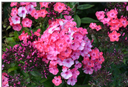
Garden Girls Glamour Girl Garden Phlox flowers