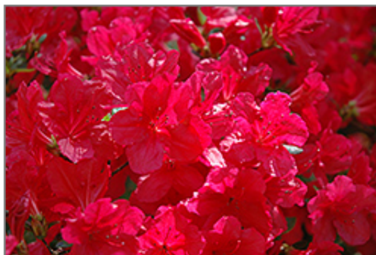
Hino Red Azalea flowers

Hino Red Azalea will grow to be about 10 feet tall at maturity, with a spread of 10 feet. It tends to be a little leggy, with a typical clearance of 1 foot from the ground, and is suitable for planting under power lines. It grows at a slow rate, and under ideal conditions can be expected to live for 40 years or more.