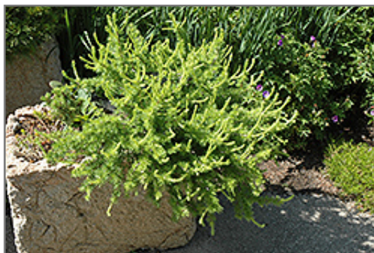
Darling Susie Larch

Darling Susie Larch will grow to be about 3 feet tall at maturity, with a spread of 3 feet. It tends to fill out right to the ground and therefore doesn't necessarily require facer plants in front. It grows at a slow rate, and under ideal conditions can be expected to live for 60 years or more.