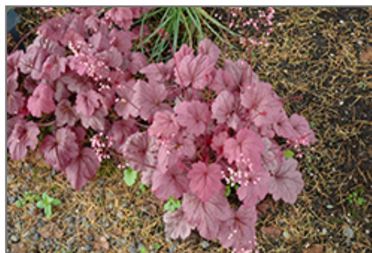
Georgia Plum Coral Bells