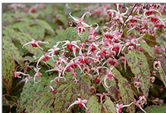
Pink Champagne Fairy Wings flowers

Pink Champagne Fairy Wings is recommended for the following landscape applications;