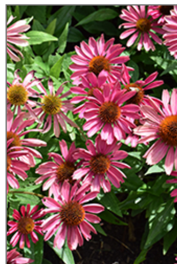
Butterfly Purple Emperor Coneflower flowers

Butterfly Purple Emperor Coneflower is recommended for the following landscape applications;