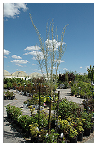
Mongolian Silver Spires Littleleaf Peashrub