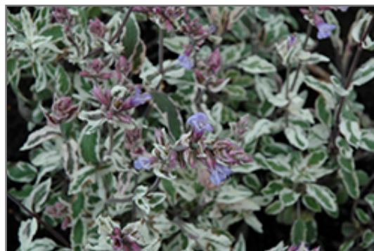
Silver Sabre Sage flowers

Silver Sabre Sage has masses of beautiful racemes of fragrant violet flowers with purple overtones rising above the foliage from early to mid summer, which are most effective when planted in groupings. The flowers are excellent for cutting. Its attractive fragrant narrow leaves are grayish green in color with showy white variegation and tinges of pink. As an added bonus, the foliage turns a gorgeous pink in the fall.