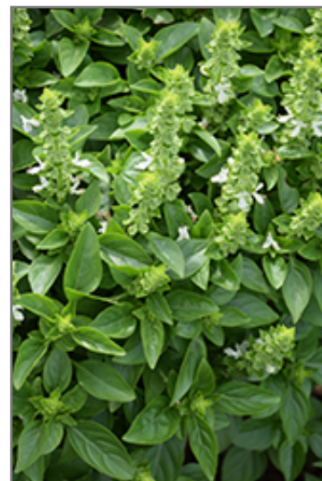
Spicy Globe Basil foliage

Spicy Globe Basil will grow to be about 12 inches tall at maturity, with a spread of 12 inches. When grown in masses or used as a bedding plant, individual plants should be spaced approximately 10 inches apart. This fast-growing annual will normally live for one full growing season, needing replacement the following year.