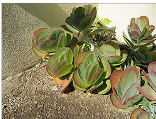
Flapjacks Kalanchoe