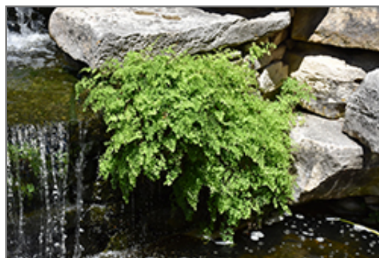
Southern Maidenhair Fern