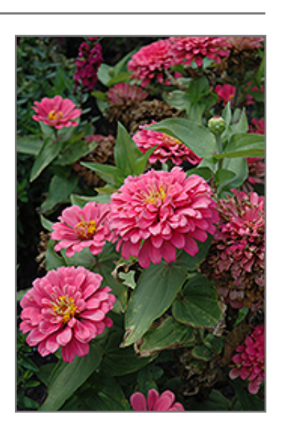
Champagne Toast Zinnia flowers

Champagne Toast Zinnia will grow to be about 16 inches tall at maturity, with a spread of 12 inches. When grown in masses or used as a bedding plant, individual plants should be spaced approximately 8 inches apart. Its foliage tends to remain dense right to the ground, not requiring facer plants in front. This fast-growing annual will normally live for one full growing season, needing replacement the following year.