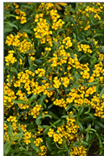
Mexican Tarragon flowers

Mexican Tarragon will grow to be about 30 inches tall at maturity, with a spread of 18 inches. Its foliage tends to remain dense right to the ground, not requiring facer plants in front. Although it's not a true annual, this plant can be expected to behave as an annual in our climate if left outdoors over the winter, usually needing replacement the following year. As such, gardeners should take into consideration that it will perform differently than it would in its native habitat.