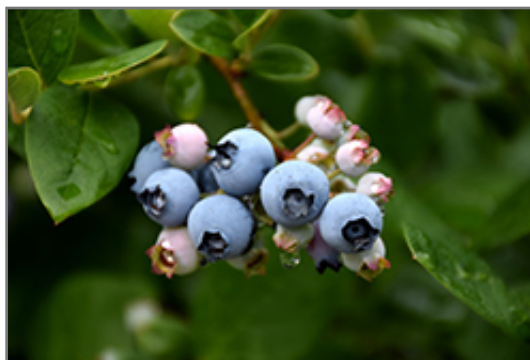
Elliott Blueberry fruit

Elliott Blueberry features dainty clusters of white bell-shaped flowers with shell pink overtones hanging below the branches in mid spring. It has green deciduous foliage. The glossy oval leaves turn yellow in fall. It features an abundance of magnificent blue berries from late summer to early fall. The smooth brick red bark adds an interesting dimension to the landscape.