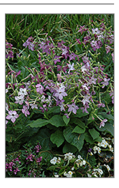
Perfume Purple Flowering Tobacco flowers