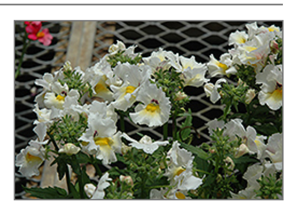
Angelart Almond Nemesia flowers

Angelart Almond Nemesia will grow to be about 14 inches tall at maturity, with a spread of 10 inches. When grown in masses or used as a bedding plant, individual plants should be spaced approximately 6 inches apart. Its foliage tends to remain dense right to the ground, not requiring facer plants in front. This fast-growing annual will normally live for one full growing season, needing replacement the following year.