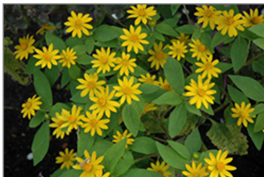
Showstar Melampodium flowers