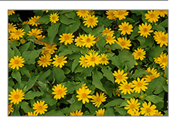
Butter Daisy flowers