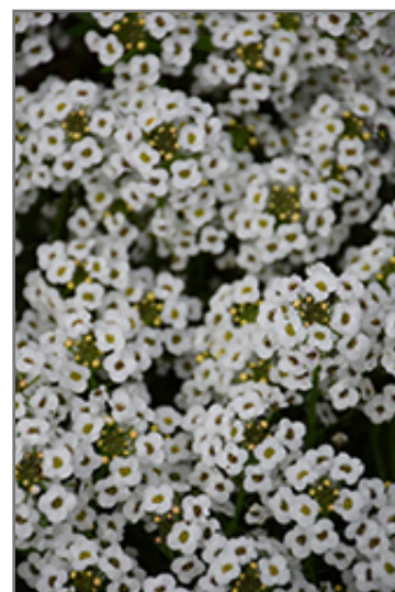
Stream White Sweet Alyssum flowers

Stream White Sweet Alyssum is recommended for the following landscape applications;