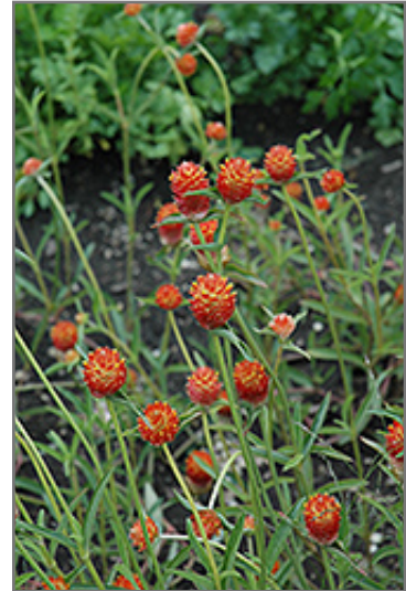
Qis Orange Gomphrena flowers

Qis Orange Gomphrena is a fine choice for the garden, but it is also a good selection for planting in outdoor pots and containers. With its upright habit of growth, it is best suited for use as a 'thriller' in the 'spiller-thriller-filler' container combination; plant it near the center of the pot, surrounded by smaller plants and those that spill over the edges. Note that when growing plants in outdoor containers and baskets, they may require more frequent waterings than they would in the yard or garden.