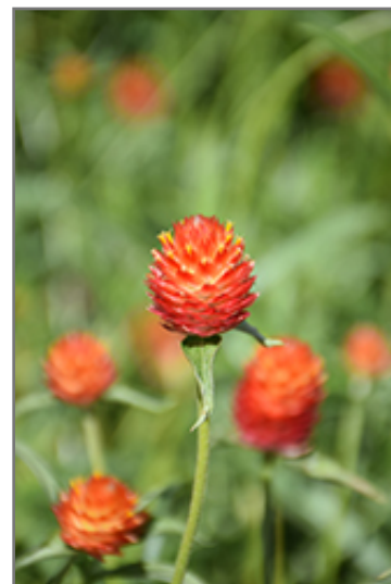
Qis Orange Gomphrena flowers