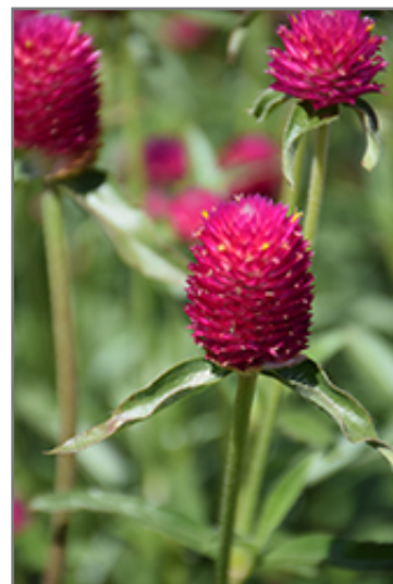
Qis Carmine Gomphrena flowers