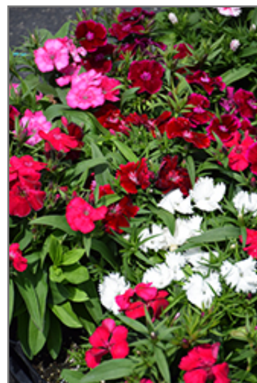
Floral Lace Mix Pinks flowers