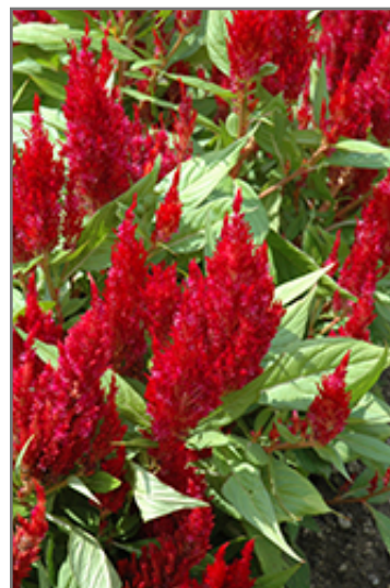
First Flame Red Celosia flowers

First Flame Red Celosia is recommended for the following landscape applications;