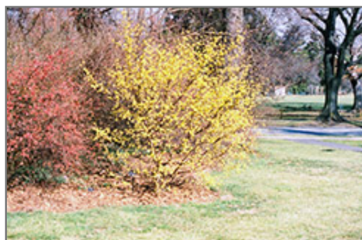
Spring Glow Cornelian Cherry Dogwood in bloom

Spring Glow Cornelian Cherry Dogwood is recommended for the following landscape applications;