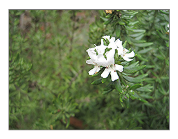
Smokey Coast Rosemary flowers