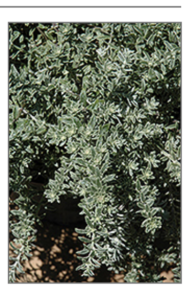
Smokey Coast Rosemary foliage