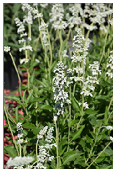
Augusta Duelberg Salvia flowers