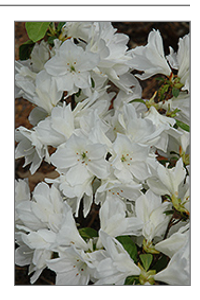
White Peacock Azalea flowers

White Peacock Azalea will grow to be about 4 feet tall at maturity, with a spread of 4 feet. It tends to be a little leggy, with a typical clearance of 1 foot from the ground. It grows at a slow rate, and under ideal conditions can be expected to live for 40 years or more.